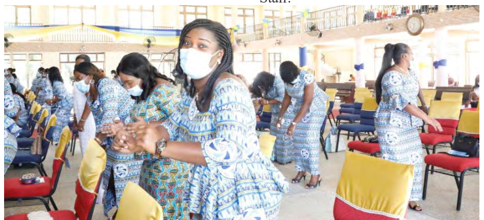
A section of the Ladies dancing to praise God