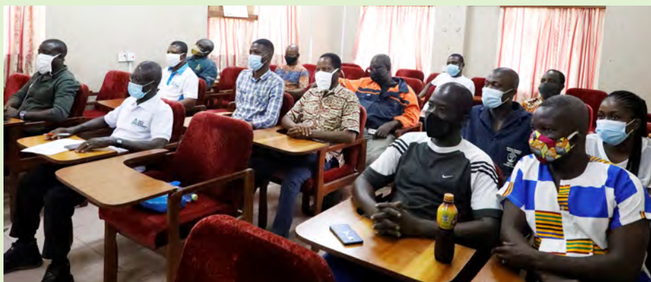
Vehicle Workshop in virtual attendance to the Programme

As part of VRA's sustainability plan, he said, Management, in January 2020, applied part of the company's internally generated funds to carry out an audit of its IT infrastructure and resources. "This was done by inviting