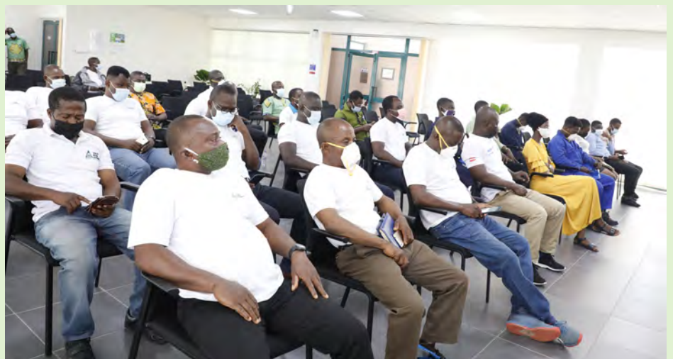
Hydro Generation Department participating in the virtual Safety Awareness Day