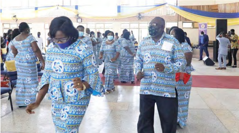
DCE Services and E&O leading the Ladies in a dance

T he Volta River Authority Ladies Association (VRALA) has held a thanksgiving service at the Akosombo Wesley Methodist Church, to roundup activities that characterised its year-long 20th anniversary celebrations. The anniversary was marked on the theme; “The New VRA, the Role of the VRA Lady.”