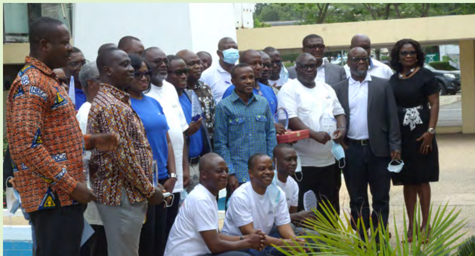
Management Staff and some WASACO award winners in a group photograph

Management of the Volta River Authority (VRA), has served notice that it will continue to beef up and maintain high level of security at the Kpong Generation Station (KGS) and other VRA power installations and subsidiaries nationwide.