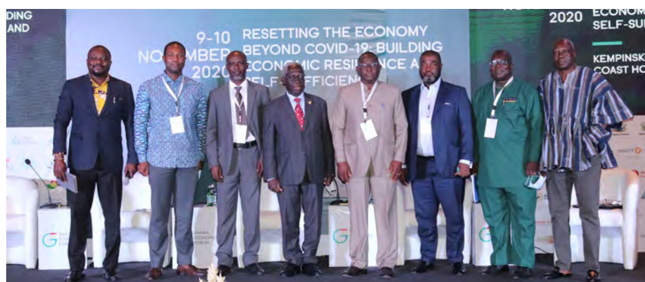
Mr. Yaw Osafo-Maafa (4th from left) and Speakers at the forum

He further noted, that "VRA has deployed the use of technology to improve our thermal plant operations and reduce operational cost and the cost of energy to customers.