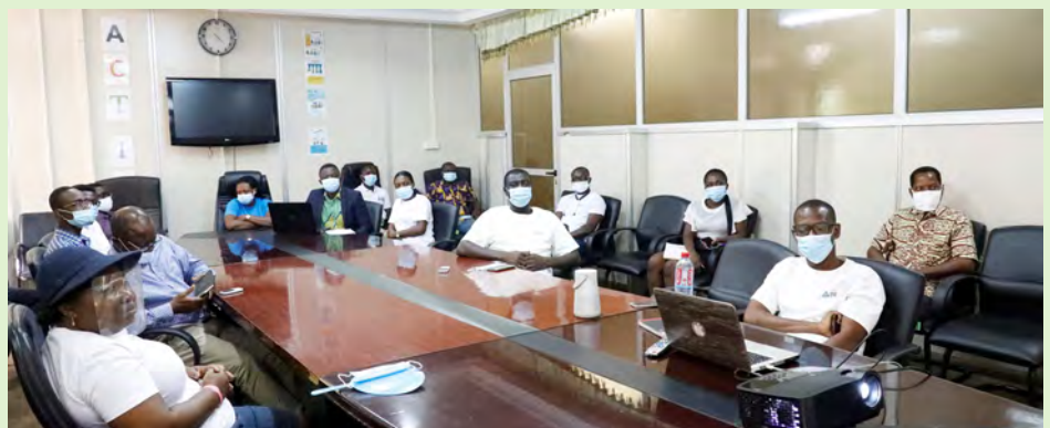
Staff of Technical Services Department gathered in their Conference room for the programme